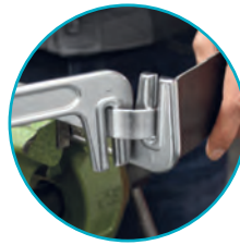
individual adapting possibility