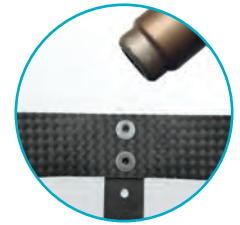
thermoformable carbon fibre calf band